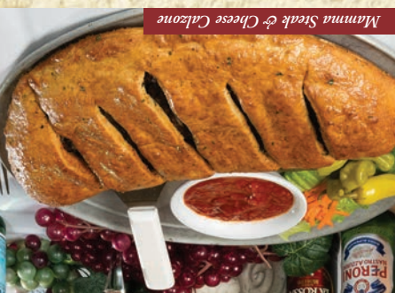
Mamma Steak & Cheese Calzone

Our Famous bread is in high demand; we prepare 6,250 lbs of bread a week! Please remember bread is served during soup and salad course to compliment your entrees, not as an appetizer.