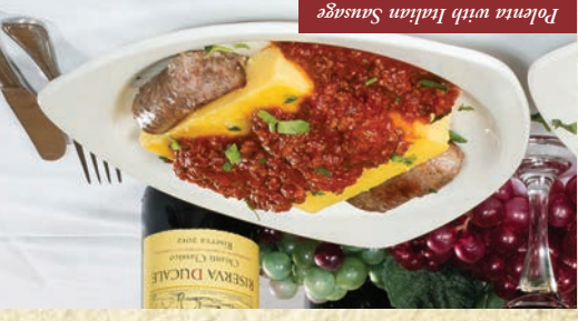
Polenta with Italian Sausage

Polenta An old family tradition. Cornmeal topped with Italian sausage and meat sauce. 11.95 Polenta with Italian Sausage An old family tradition. Cornmeal topped with Italian sausage and meat sauce. 12.95 Polenta with Italian Sausage An old family tradition. Cornmeal topped with Italian sausage and meat sauce. 12.95 Polenta with Italian Sausage An old family tradition. Cornmeal topped with Italian sausage and meat sauce. 12.95