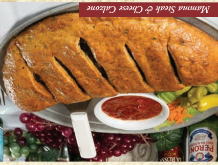
Mamma Steak & Cheese Calzone

Our Famous bread is in high demand; we prepare 6,750 lbs of bread a week! Please remember bread is served during soup and salad course to compliment your entrees, not as an appetizer.