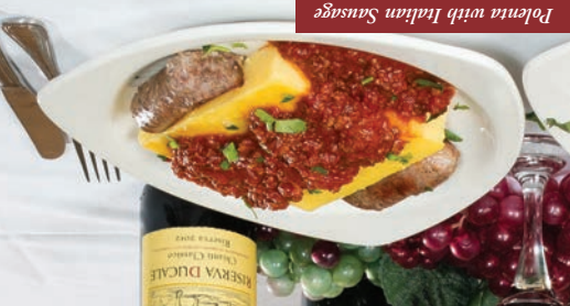
Polenta with Italian Sausage