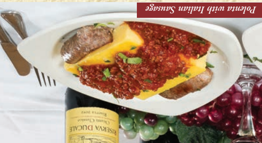
Polenta with Italian Sausage