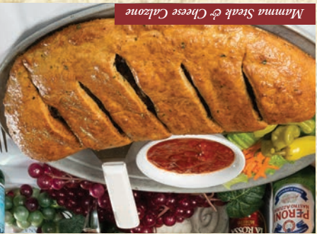
Mamma Steak & Cheese Calzone

Our Famous bread is in high demand; we prepare 6,250 lbs of bread a week! Please remember bread is served during soup and salad course to compliment your entrees, not as an appetizer.