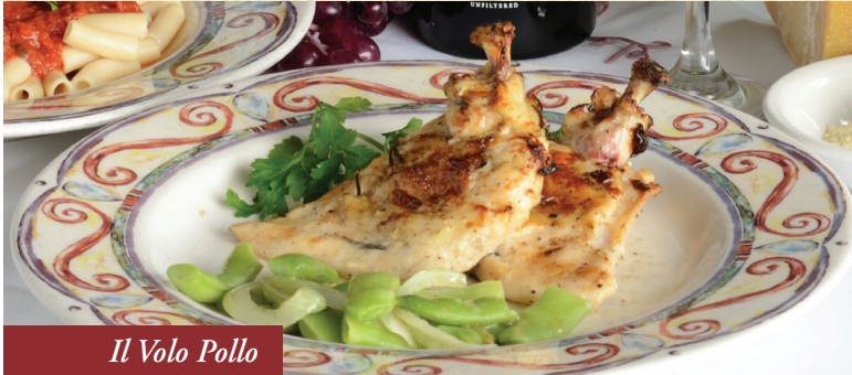
Il Volo Pollo